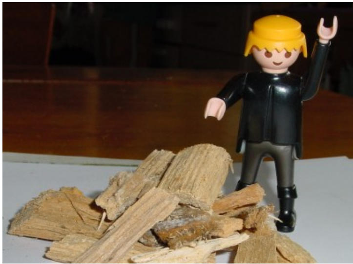
Wooden chips for the new heating plant