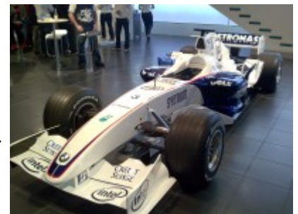
BMW Sauber race car

On a more positive note, about a month ago Credit-Suisse sponsored a visit to the BMW Sauber Formula One Racing Labs in Hinwil, about 30mins from here. There was a brief introduction by Peter Sauber himself, and a live transmission of the Brazilian GP, but Aksel and I really just went for the food, and to see the wind-tunnel and the supercomputer. (all very impressive, also the food).