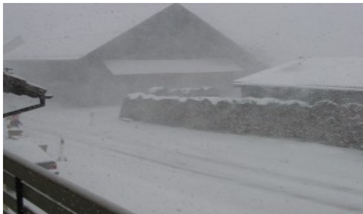
Snow in late March 2008

Tradition? It's that time again – Christmas time and newsletter time. I think the 3 rd issue makes this newsletter a tradition doesn't it?